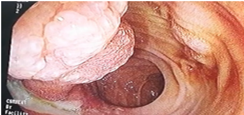
Figure 2. Endoscopic image of duodenum after megastent removal after nine weeks. shows a large pedunculated polyp with clean base ulcer seen on the root of the polyp.