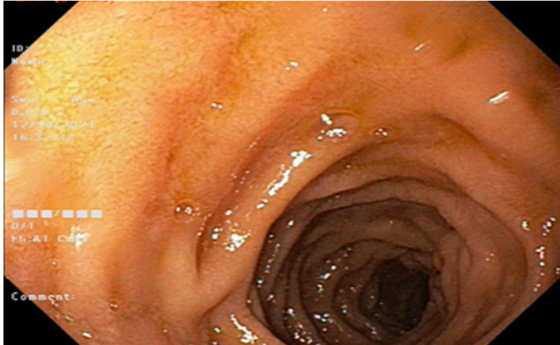
Figure 1. Endoscopic image of the first and second part of the duodenum (D1 & D2) on initial OGD showed no polyp in D2.