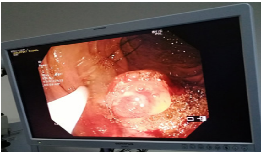
Figure 3. Endoscopic image of duodenal polypectomy.