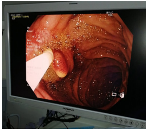
Figure 4. Endoscopic image of duodenal polypectomy.